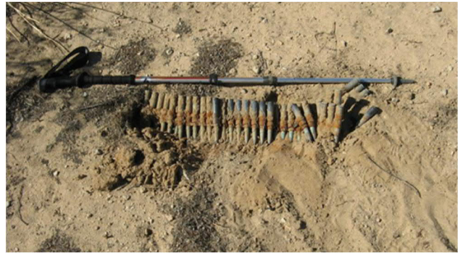
Even small munitions can be dangerous and should be treated with caution.