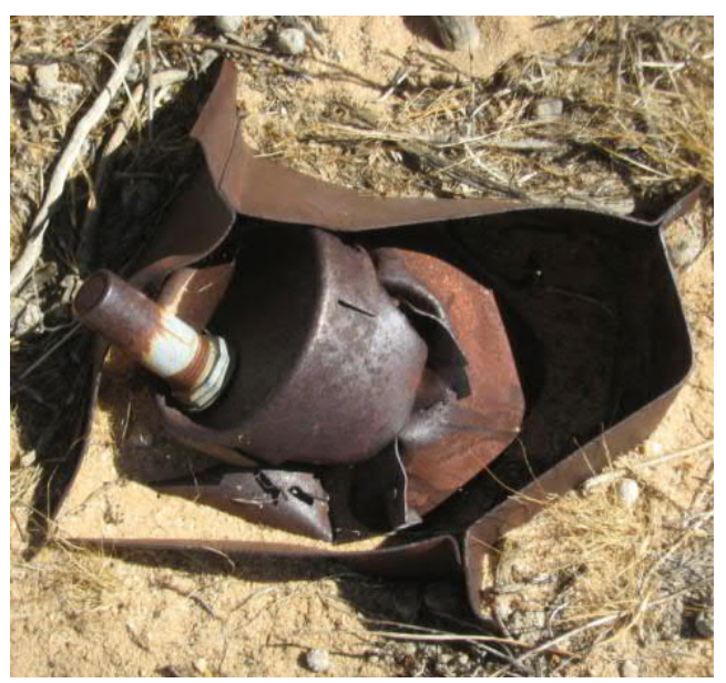
Munitions that seem to be severely damaged or incomplete can still be dangerous, especially if explosive fuzes are intact.