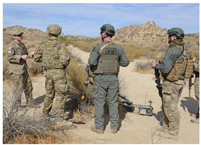
The Kern County Sheriff's Office Bomb Squad and Edwards AFB Explosive Ordnance Disposal (EOD) teams are trained to safely respond to UXO and DMM hazards.