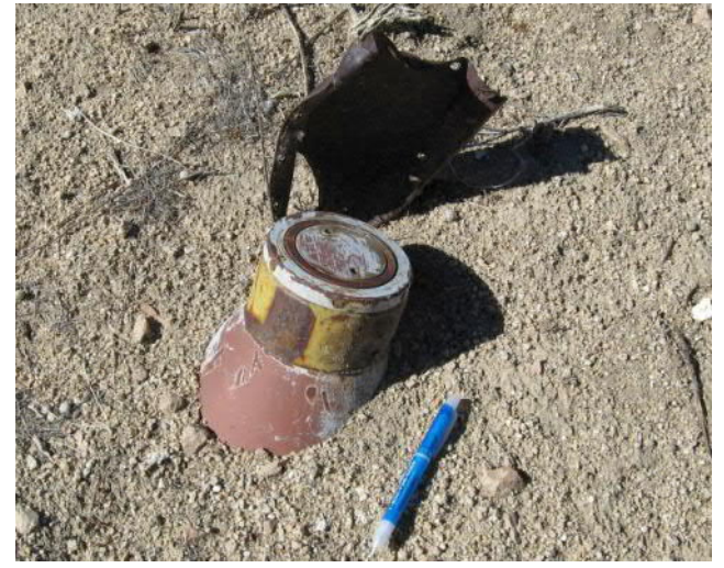
Even practice bombs can have explosive flash or spotting charges.