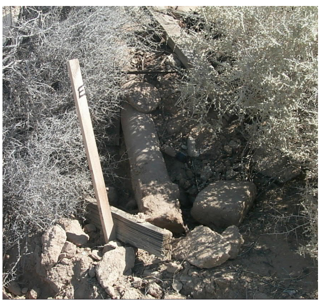
Munitions can be hard to see, especially when they have had years to rust and settle into place. Beware as munitions can be hidden by deep grass or brush.