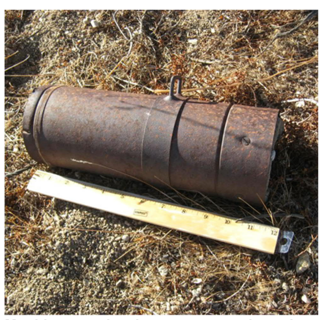
Munitions can be clean or rusty and may be hard to recognize. Even old munitions can be very dangerous.

Report – When you think you may have encountered a munition, notify your local law enforcement – call 911.