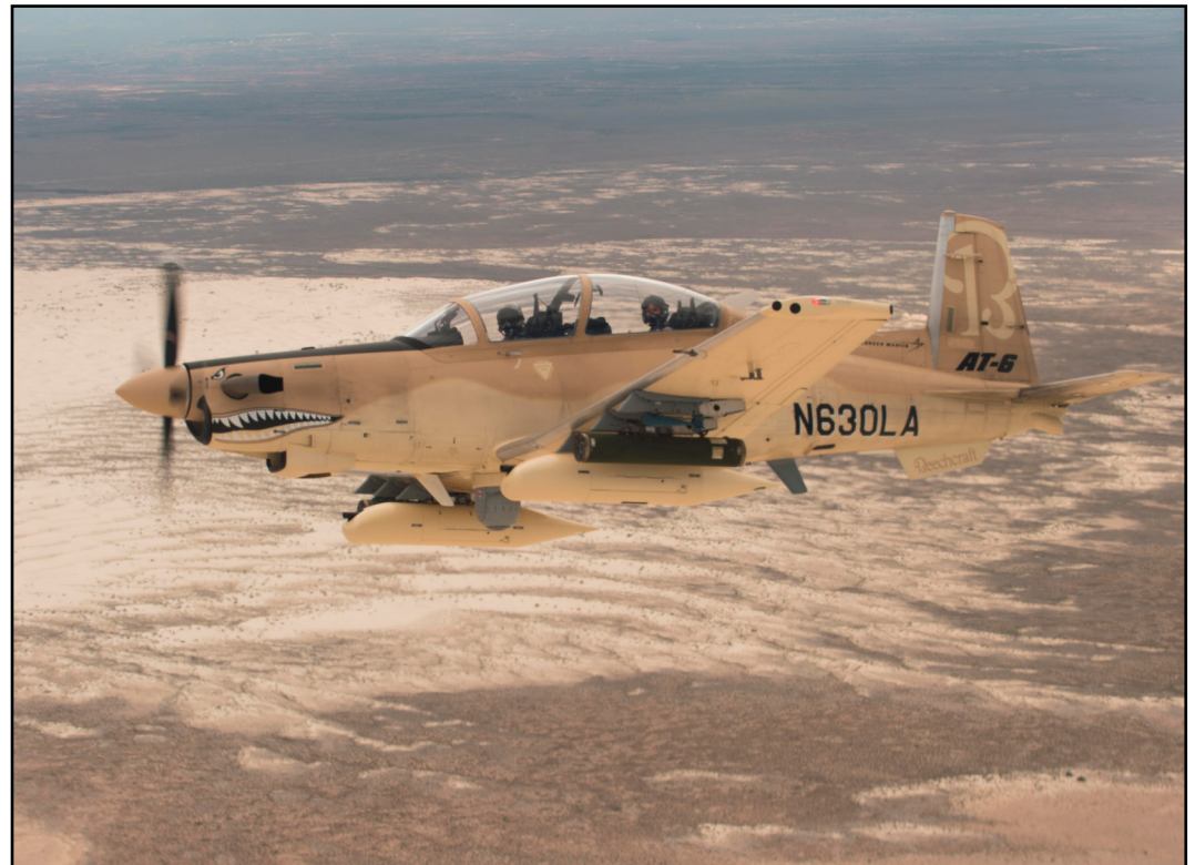
A Beechcraft AT-6 experimental aircraft flies over White Sands Missile Range, New Mexico, July 31, 2017. The AT-6 is participating in the U.S. Air Force Light Attack Experiment (OA-X), a series of trials to determine the feasibility of using light aircraft in attack roles.

"We're where we're at today because both Congress and our industry partners understood the need to find ways to get capabilities to our warfighters faster," she said.