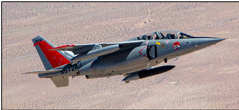
A Gauntlet Aerospace Alpha Jet flies above the Mojave Desert earlier this year. Two Alpha Jets have been contracted to serve as chase aircraft for test missions at Edwards. The 412th Operations Group is conducting an experiment to determine if the planes can successfully provide needed test support.