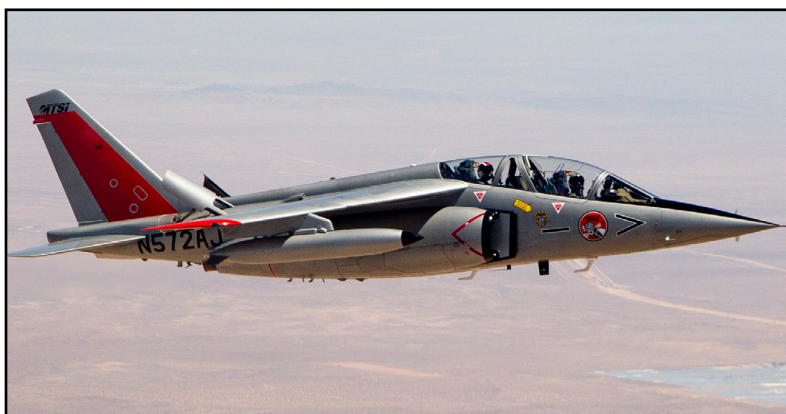
A Gauntlet Aerospace Alpha Jet flies above the Mojave Desert earlier this year. Two Alpha Jets have been contracted to serve as chase aircraft for test missions at Edwards. The 412th Operations Group is conducting an experiment to determine if the planes can successfully provide needed test support.

test missions with F-16s, F-15s, F-22s, B-1s and F-35s, he said.