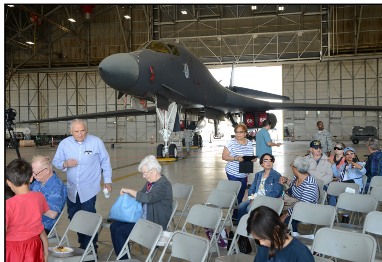
The 2018 Military Retiree Appreciation Day took place in Hangar 1210 with a B-1 Lancer on display for the event this year.

The keynote speaker for the event was retired U.S. Navy