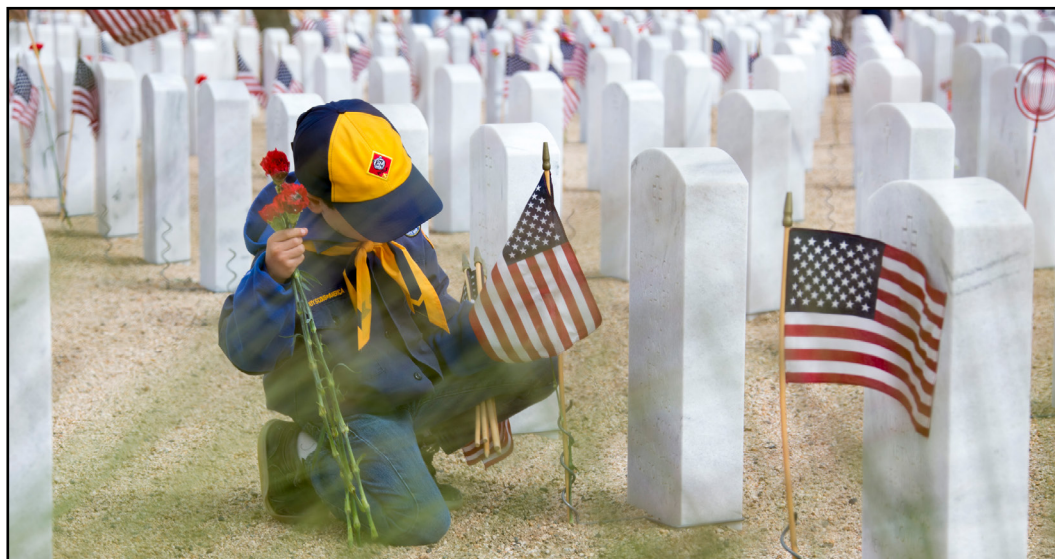
A local Cub Scout places a flag at the grave of a past servicemember May 26 at Bakersfield National Cemetery.

By Kenji Thuloweit 412th Test Wing Public Affairs