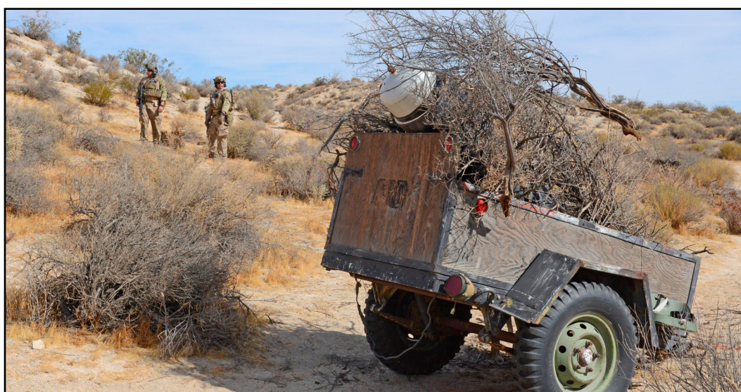
Explosive Ordnance Disposal Airmen inspect an improvised rocket Nov. 4 as part of a two-week long training event and bivouac conducted by the 812th Civil Engineer Explosive Ordnance Flight at Edwards AFB earlier this month.