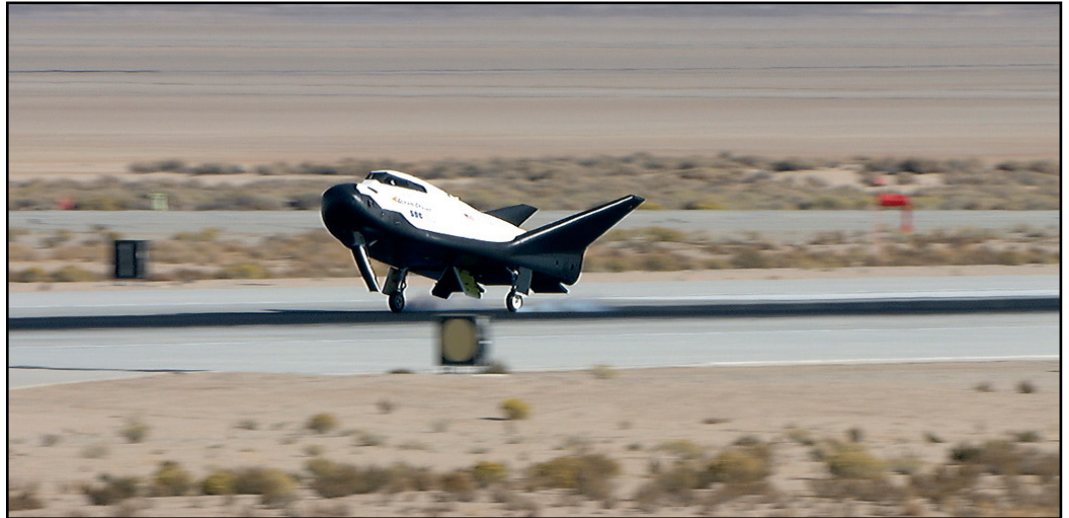
Sierra Nevada Corp's Dream Chaser lands on Edwards Air Force Base. The spacecraft went through preparations for flight at NASA's Armstrong Flight Research Center.

The flight test helped advance the vehicle under NASA's Commercial Crew Program space act agreement, as well as helped prepare the vehicle for service under NASA's Commercial Resupply Services 2 program. The testing will validate the aerodynamic properties, flight software and control system performance of the Dream Chaser.