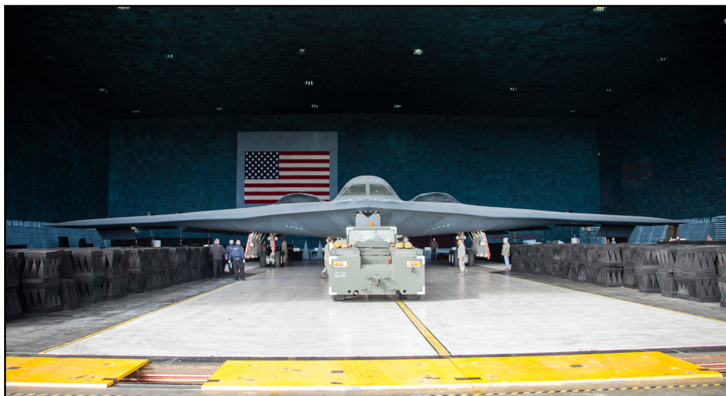
A B-2 Spirit bomber sits in the Benfield Anechoic Facility Nov. 28, 2016, preparing to undergo environmental control systems checks. The Air Force released photos this week of the stealth bomber's first time in the BAF.

Completed in July 1989, the BAF continuously conducts electronic warfare testing on all types of aircraft, from U.S. Air Force aircraft to allied nations air-