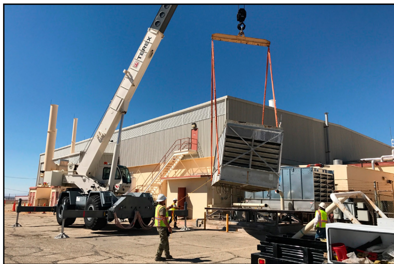
A crane lifts away an old cooling tower at Air Force Research Laboratory's Rocket Propulsion Division's chemical laboratory earlier this year. The 412th Civil Engineer Squadron recently completed a seven-month project replacing two cooling towers and a 40-ton condensing unit at the Rocket Lab. (Courtesy

By Kenji Thuloweit 412th Test Wing Public Affairs