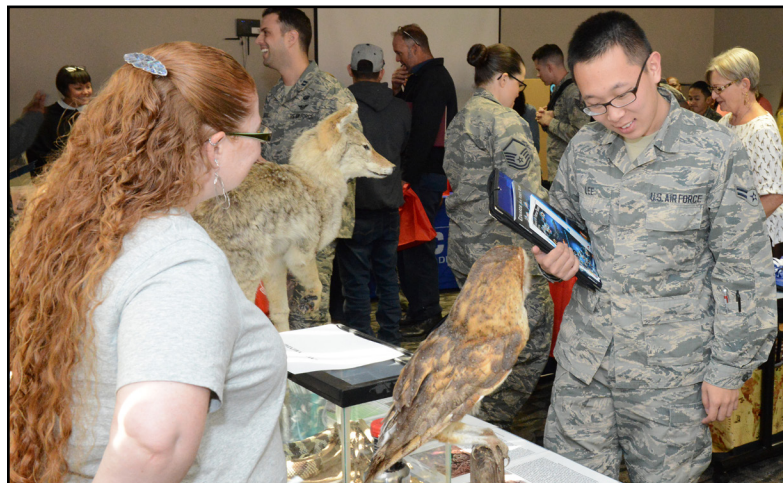
A member the 412th Civil Engineer Group Environmental Management stands by her information booth, ready to answer questions, at the Airman and Family Readiness Center Nov. 2. Environmental Management was one of two dozen organizations invited to participate in an information fair put on by 412th Force Support Squadron Family Readiness during the monthly Newcomer's Orientation Briefing.

those interested in finding a pet or possibly volunteering; Environmental Management, which showed off a non-poisonous snake and information on the local wildlife in the area; as well as the First Sergeants Association, Toastmasters and many others who brought free giveaways.