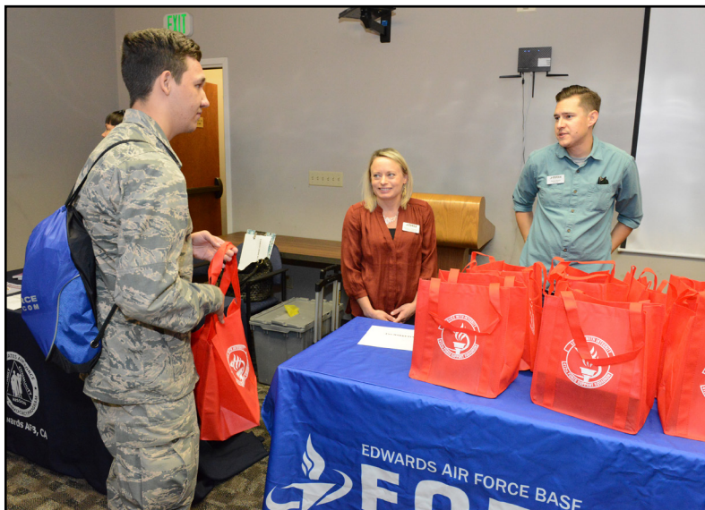
Many participants at the Newcomer's Orientation Briefing information fair Nov. 2 handed out free gifts as a way to welcome those new to Edwards AFB.

The participating agencies include APET (Adopt-a-Pet) for