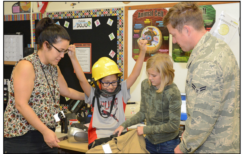
While the younger students were outside, fourth- and fifth-graders at Branch Elementary got the chance to meet members of the Edwards Air Force Base Fire Department and even don a real fire-fighting uniform Oct. 10.