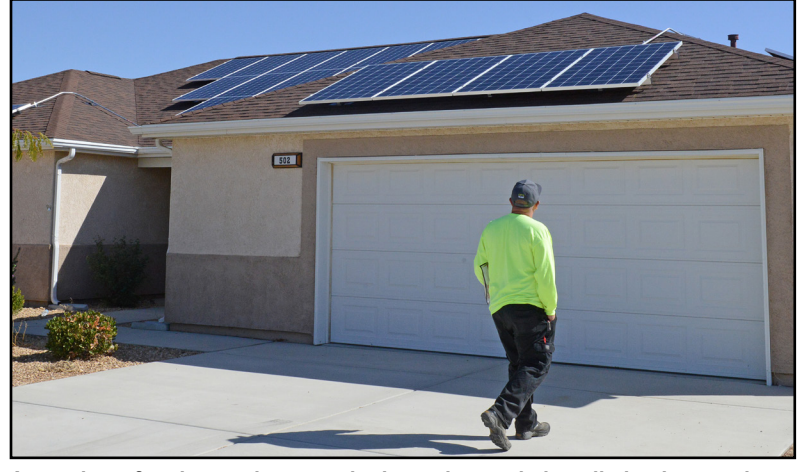
A member of an inspection team looks at the newly installed solar panels on this vacant house in the Tamarisk Plains neighborhood Oct. 11. This house is the first of 368 homes to be fitted with solar panels on Edwards Air Force Base.

The 412th CEG Energy Management Team assisted Corvias through their planning and design process such as the allocation and approval of their power generation plans and has served as the liaison with the local electric power utility to reach an interconnectivity agreement that will support more than 3 megawatts of electrical power – about 80% of power