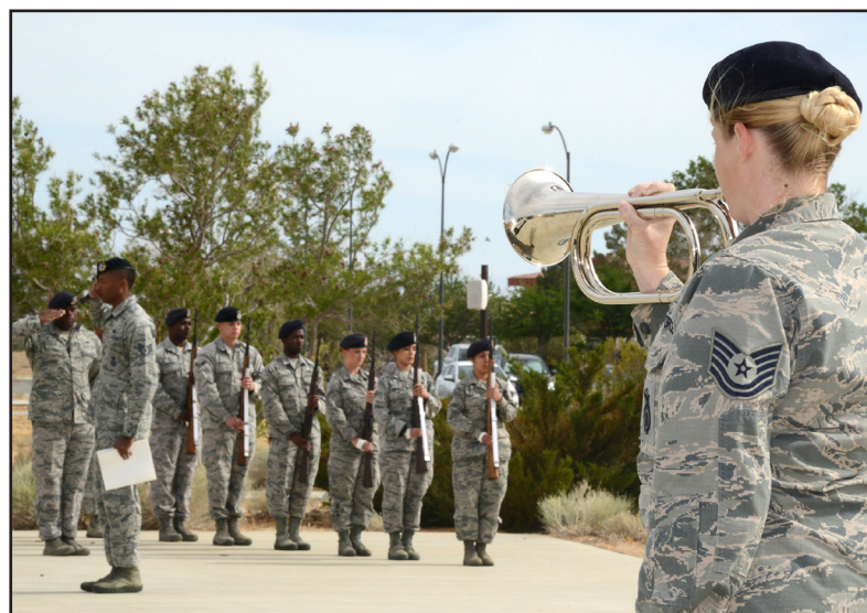
412th Security Forces Squadron members at last year's National Police Week retreat ceremony.

National Police Week is always the calendar week beginning on Sunday, which includes May 15. On page 2 is a list of events along with contact information if you'd like to participate. Come out and help make these events be the best they can be!