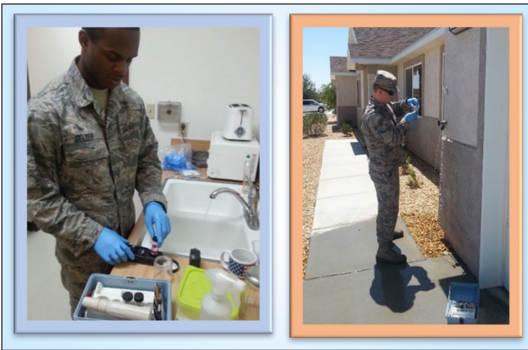
Pictured above: Technicians from the 412th Operational Medical Readiness Squadron, Bioenvironmental Engineering Flight conducting routine water testing at locations spanning the water distribution system. Water samples are collected, tested by a certified laboratory, and results are submitted to the State Water Resources Control Board to demonstrate compliance with all requirements and regulations.