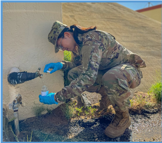
Pictured above: A technician from the 412th Operational Medical Readiness Squadron, Bioenvironmental Engineering Flight conducting routine water testing at locations spanning the water distribution system. Water samples are collected, tested by a certified laboratory, and results are submitted to the State Water Resources Control Board to demonstrate compliance with all requirements and regulations.