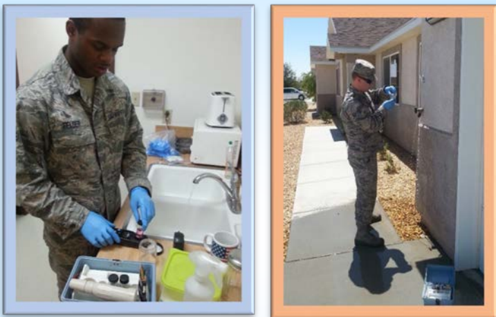
Pictured above: Technicians from the 412th Operational Medical Readiness Squadron, Bioenvironmental Engineering Flight conducting routine water testing at locations spanning the water distribution system. Water samples are collected, tested by a certified laboratory, and results are submitted to the State Water Resources Control Board to demonstrate compliance with all requirements and regulations.

Our water is treated with chlorine, which is a disinfectant that kills dangerous bacteria and other microorganisms that may be in the water. The 412th Civil Engineering Squadron monitors the disinfectant levels on a daily basis.