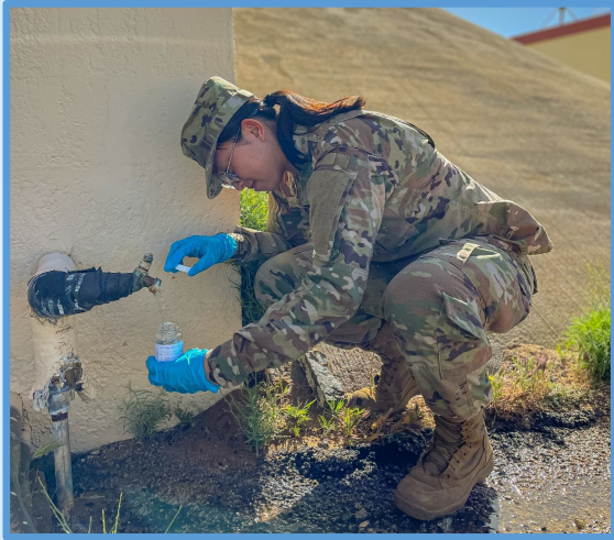
Pictured above: A technician from the 412th Operational Medical Readiness Squadron, Bioenvironmental Engineering Flight conducting routine water testing at locations spanning the water distribution system. Water samples are collected, tested by a certified laboratory, and results are submitted to the State Water Resources Control Board to demonstrate compliance with all requirements and regulations.