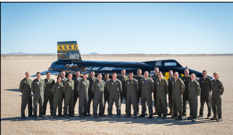
U.S. Air Force Test Pilot School Class 17B poses in front of the X-15 hypersonic rocket plane in March 2018. The class graduated June 8.

By Kenji Thuloweit 412th Test Wing Public Affairs