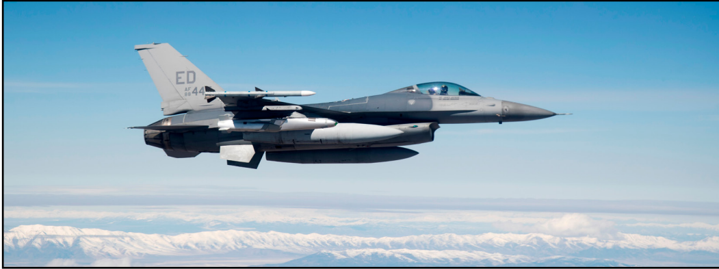
A U.S. Air Force F-16 Fighting Falcon carries a developmental test version of Norway's Joint Strike Missile. The 416th Flight Test Squadron recently wrapped up JSM testing.

By Kenji Thuloweit 412th Test Wing Public Affairs