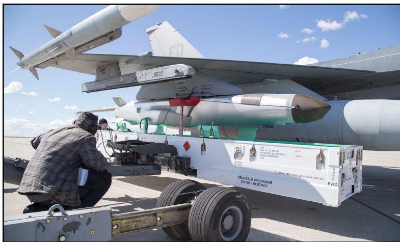
A weapons load team prepares to remove a Joint Strike Missile from a 416th Flight Test Squadron F-16 Fighting Falcon following a captive carriage test flight, Feb. 27, 2018.

of the program with the first JSM being a glide-only weapon with an active autopilot, but without a live engine, according to Drake. The next several tests used a version of the JSM that still did not have a warhead, but had a live engine and navigation avionics. The different variants proved the JSM could sustain extended periods of flight under its own power and successfully navigate over different terrain.