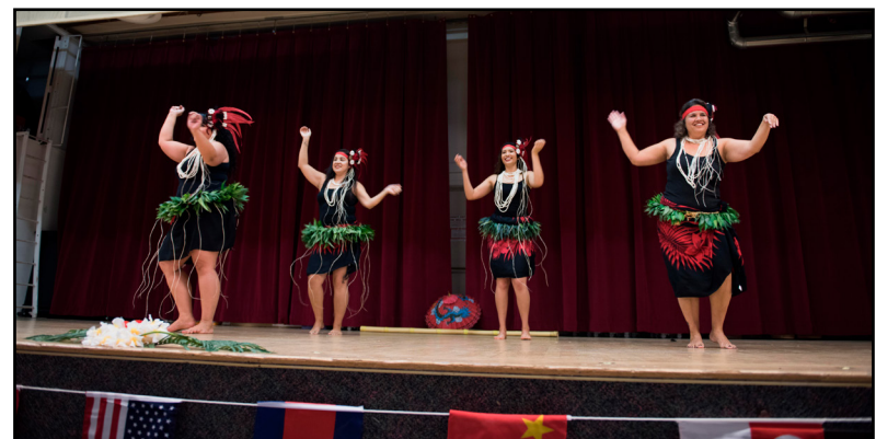
Traditional dances and music performances accompanied Far East and Pacific foods at the Asian American Pacific Islander Heritage Month culture show and food tasting event at Stripes Lounge last May. This year's finale will be held May 22 at the Airman and Family Readiness Center.

Some notable events that the Heritage Month commemorates is the first Japanese immigrants to come to the United States May 7, 1843, and the completion and anniversary of