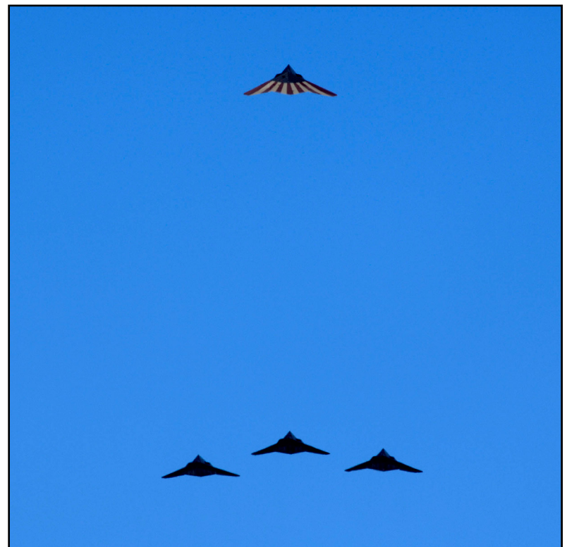
Four F-117A Nighthawk's perform one last flyover at the Sunset Stealth retirement ceremony at Holloman AFB, N.M., April 21, 2008. The F-117A flew under the flag of the 49th Fighter Wing at Holloman Air Force Base from 1992 to its retirement in 2008.

"I think we all recognized that this was something historic," he said. "We retired an airplane that people still reference today. We really understood that so it was a sentimental flight to say the least. It was a great weapon system, very stable and easy to fly. It's still a memorable experience."