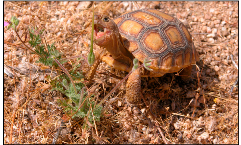
Pictured is a juvenile desert tortoise. Even with conservation efforts, desert tortoise numbers continue to decline. Edwards Environmental Management is partnering with San Diego Zoo Global and the United States Geological Survey in an effort to increase the desert tortoise population through head-starting and translocation research.

A previous head-start program was initiated in 2002 at Edwards AFB and resulted in the construction of the desert tor-