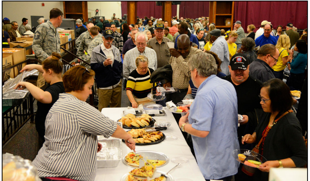
Edwards AFB hosted more than 300 guests at last year's Retiree Appreciation Day. The 2018 Retiree Appreciation Day is scheduled for May 19.