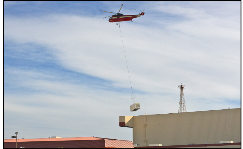
An S-61V Sikorsky helicopter lifts an old cooling unit off of Bldg. 1600 April 7 to be placed down at a parking lot nearby.