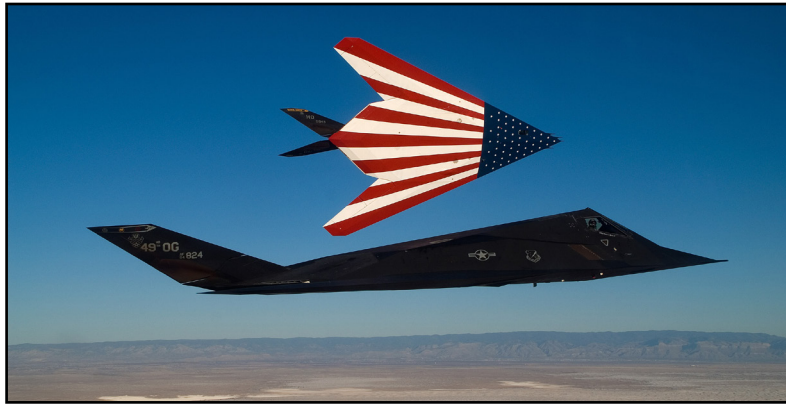
Two specially painted F-117 Nighthawks fly on one of their last missions. The F-117s were retired in a farewell ceremony at Wright-Patterson Air Force Base, Ohio, April 22, 2008.