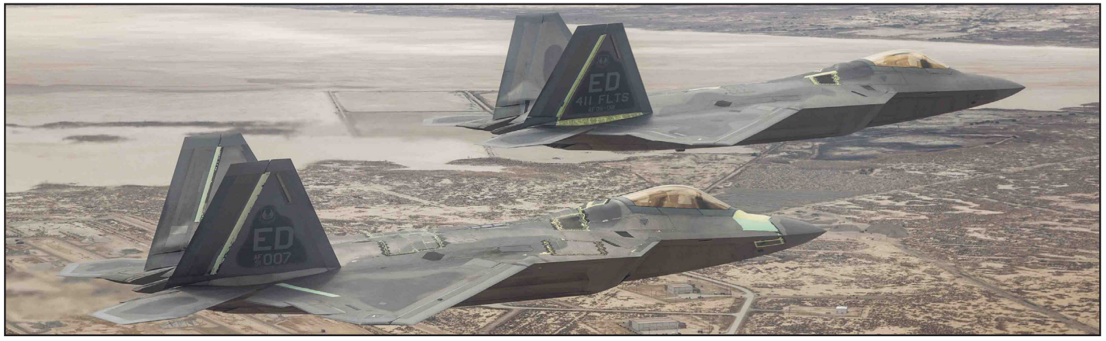
By Christopher Ball 412th Test Wing Public Affairs

The U.S. Air Force announced June 14 that the 412th Test Wing's F-22 Modernization Flight Test Team won the 2017 Air Force Association Citation of Honor Award for their outstanding contributions to the country's national defense.