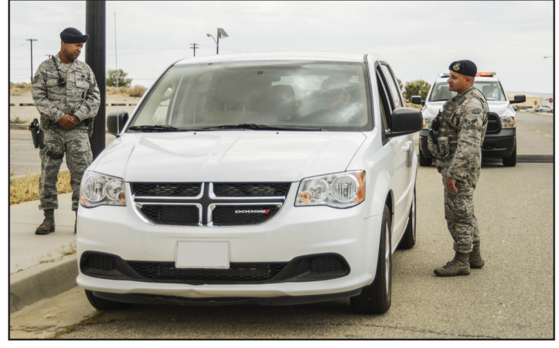
Defenders from the 412th Security Forces Squadron pull over a van for speeding.

The stance that we are taking now is to eliminate the risk of injury, harm or damage to anyone, any property and to protect the entire base.